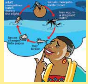
You need to understand your enemy's life cycle in order to fight them