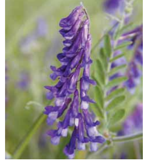
Purple vetch can accumulate 90 kg of nitrogen per acre and will provide about 45 kg of nitrogen per acre to the subsequent crop.

The chicken housing should be comfortable, if temperatures are higher than normal, the birds become easily irritated which causes pecking. If the birds have inadequate nutrients such as methionine and salt in their feed; this increases craving for feathers and blood and hence pecking.