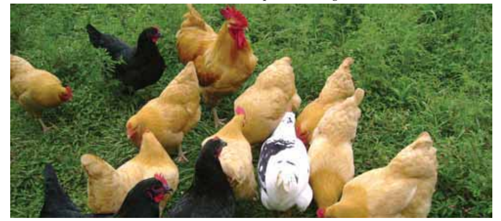
Good housing and proper feeding are very important in poultry keeping.

• Holes in the bag or container can spoil the silage. tsz