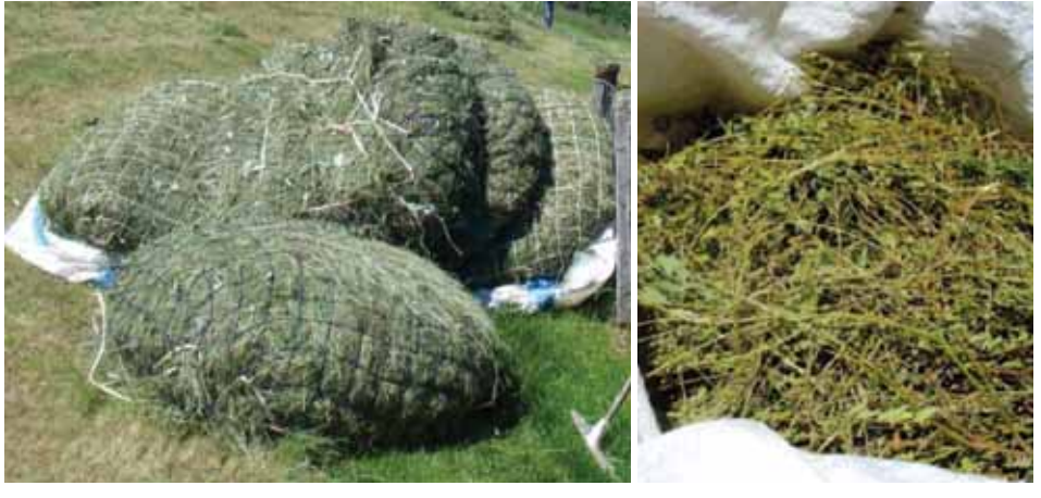
The green colour of dried hay indicates it is still nutritious. Dried, green leucaena hay(right)

The reports in the The Organic Farmer do not necessarily reflect the views of icipe