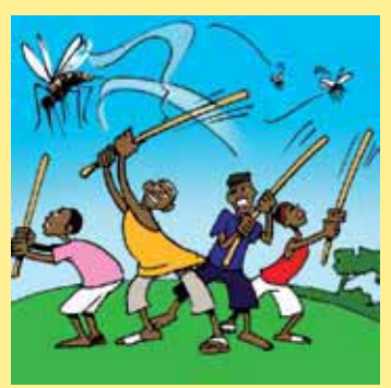
There are too many mosqui-toes. They can't kill them all!

Mama Fatuma knows where malaria comes from