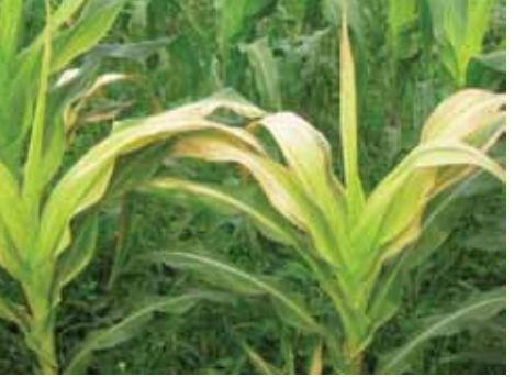
Maize plants infected by MLN disease start drying from the leaves downwards.

All varieties of maize planted in all above-mentioned regions are affected by the disease, which reduces the crop options for farmers. Research institutions have set up two trial sites in Naivasha and Bomet to test the resistance levels of different maize varieties to the disease. The disease has no cure.