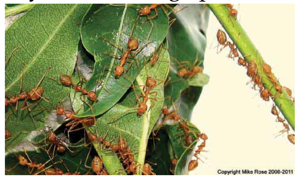
Weaver ants (above) eat fruit flies (right), their larvae and other pests thus controlling them naturally.

Weaver ants consume a large amount of food, and workers continuously kill a variety of insects for this purpose. Because weaver ants prey on harmful plant pests, any plant inhabited by weaver ants has low pest levels. Weaver ants have proved to be effective biocontrol agents against agricultural pests especially in horticultural crops such as mango and cashewnut plantations. Fruit trees harbouring weaver ants produce