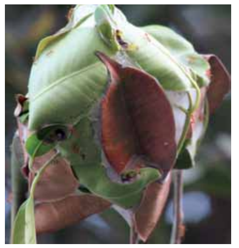
Weaver ants derive their name from the way they weave their nests using plant leaves.

This article is a translation of a text published in our sister magazine, Mkulima Mbunifu, which is distributed in Tanzania.