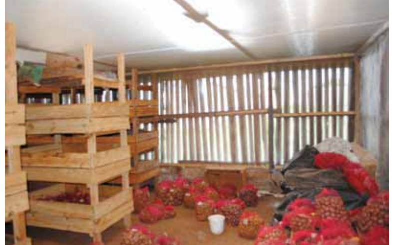
knowledge Seed potatoes in a Diffused Light Store (DLS) (above). The more the on the benefit sprouts in a potato seed tuber (below), the higher the yield.

• Do not use synthemic bags for potato storage, sisal bags are ideal as they allow